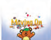
Moving On Cover